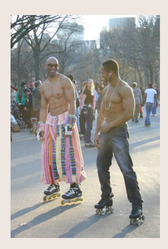
Rollerblading in Central Park

There will always be a "General Questions" section on the discussion board where you can post any questions about the course. Please use this forum rather than emailing me directly (unless it is a personal matter - individual grades, missing assignments, etc) so others can see the answers in case they have the same questions. Please subscribe to this forum as it will often give clarifications of relevance to evervone!