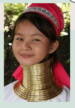
Neck stretching is seen in many Thai groups

not ensure that you really know the material. Take the time to make notes while reading the lectures and watching any videos, outline the chapter as you read it. Make sure you take the exam at a time when you can completely focus on the exam if you are interrupted while taking it, the time keeps going. You must finish the exam the first time you begin. This means that if you have a computer or internet problem while taking the test, you will not be able to get back into the exam to finish it. DO NOT wait until Sunday night to begin the exam - the servers are often very busy then and you may have a problem taking the exam. Exams go offline at midnight Sunday night with NO exceptions. BE SURE to log in before 10:30pm to get the full 90 minutes to complete the exam. If you pause for a long time, answer instant messaging, open another website, or